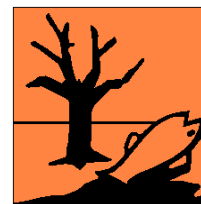
Dangerous to the environment